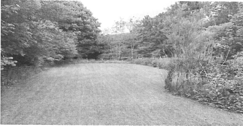
Flat area in daylight for trees to be planted (No 2 on plan)