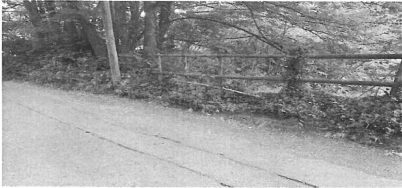
Pedestrian access to be created where existing rotten wooden fence is (No 4 On Plan)