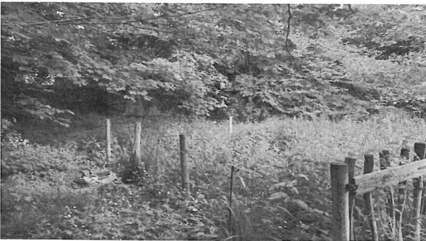
Shaded area near access to be cleared and seating to be installed (No 3 on plan)