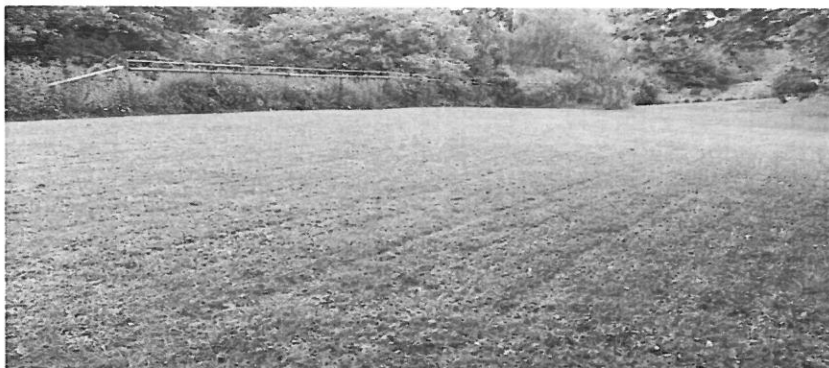
Flat area in daylight for trees to be planted (No 2 on plan)