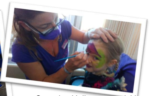
Saturday Halloween activities morning goes well for young readers getting their face painted.