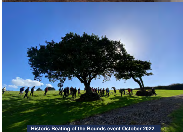
Historic Beating of the Bounds event October 2022.