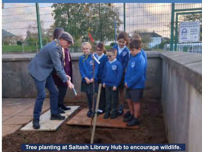
Tree planting at Saltash Library Hub to encourage wildlife.

Did you know your Councillors are on Fore Street for 'Meet your Councillors' every second Saturday of the month outside Bloom Hearing Specialists. Come and give us your views.