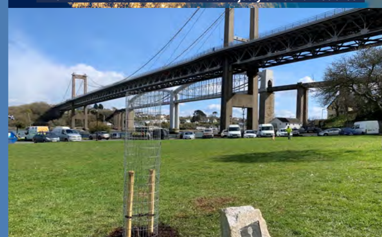
Darley Oak planted in celebration of Her Late Majesty's Platinum Jubilee.