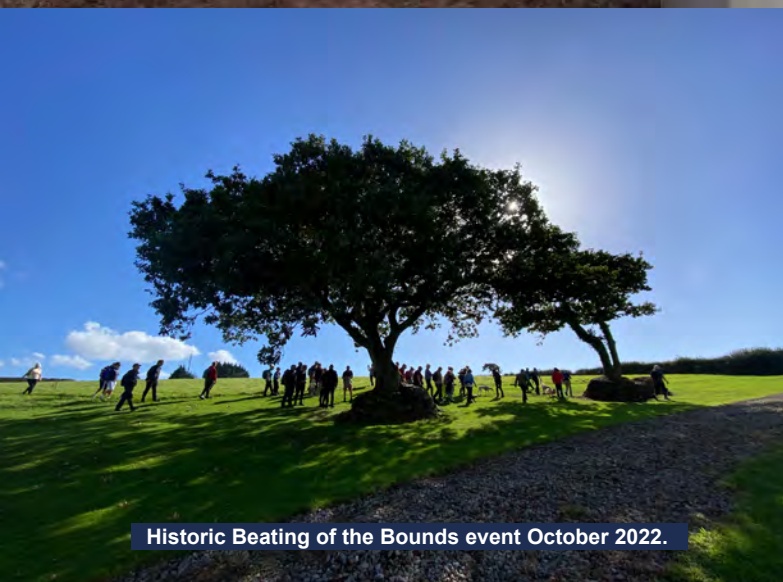
Historic Beating of the Bounds event October 2022.