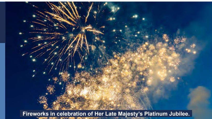
Fireworks in celebration of Her Late Majesty's Platinum Jubilee.

The Town Council offer further room hire discounts to community organisations. To find out more visit https://www.saltash.gov.uk/facilitiesforhire.php