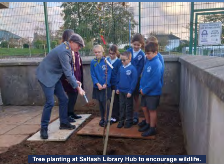
Tree planting at Saltash Library Hub to encourage wildlife.

Did you know your Councillors are on Fore Street for 'Meet your Councillors' every second Saturday of the month outside Bloom Hearing Specialists. Come and give us your views.