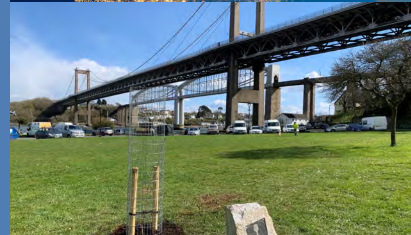
Darley Oak planted in celebration of Her Late Majesty's Platinum Jubilee.