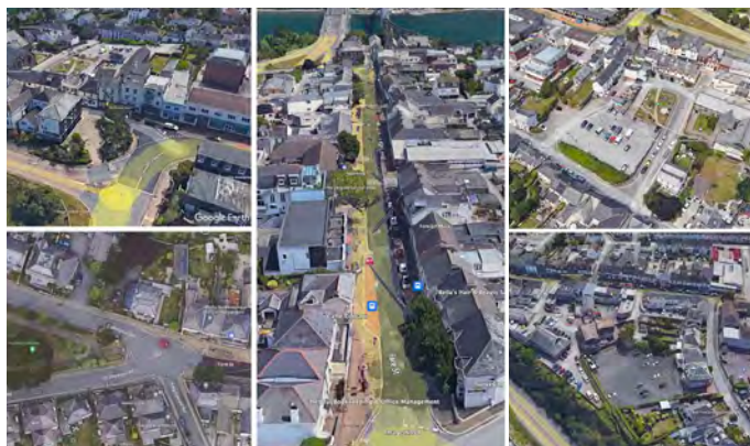
Study Areas: Car Parks, Town Gateways and Fore Street