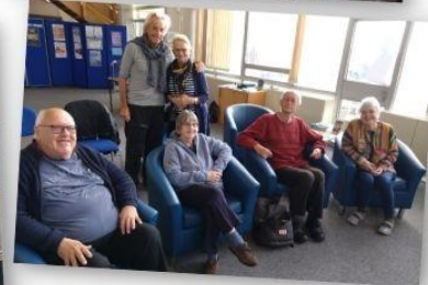
Many thanks to all the authors that visited.