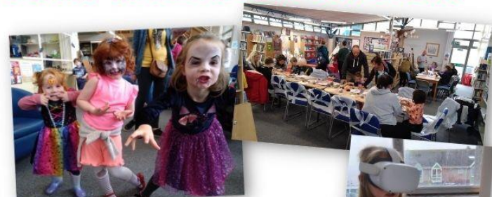
Scary morning with the face painted Princesses. Loads of fun and mess with the Halloween clay club and watch out for the 3D VR flying broom witches!

For Ukrainian nationals needing support email:- homesforukraine@cornwall.gov.uk