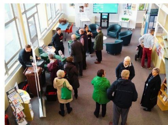
CORNWALL COUNCIL WASTE ENGAGEMENT ROADSHOW