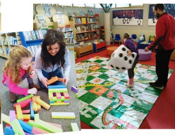
GIANT CRAZY GAMES DAY